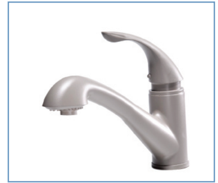
Figure 3. Metallizing the Objet model with a conductive surface

Metal Plating is the method of applying a metallic coating to another material. There are many reasons to plate objects. They can be applied to almost any coarse material. Plating can be used for different reasons. Some models are plated to increase their sturdiness and provide a hard shell for whatever it is plate on. Some are plated to avoid corrosion, and a few are plated just to give off an attractive finish.