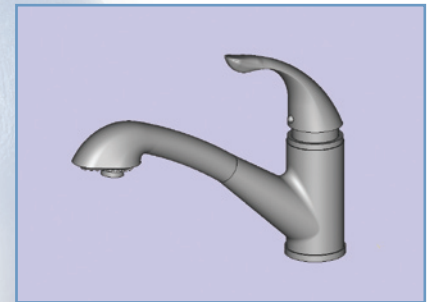
Figure 1. Faucet model design by CAD

The etch bath consists of a highly concentrated acid solution of chromic and sulfuric acid. The solution oxidizes selective areas on the Objet part. The holes produced by the oxidizing action are absorbing sites that hold small metallic particles that serve as activators for electroless plating. The hole size influences adhesion and other physical properties. After etching, the plastic is thoroughly rinsed.