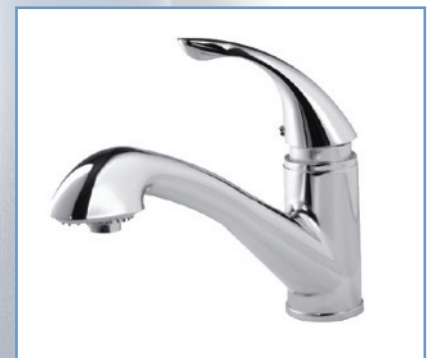
Figure 5. Final metal coating with Nickel